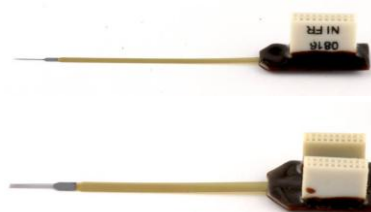
HC16 / HC32 Package Package with percutaneous connectors